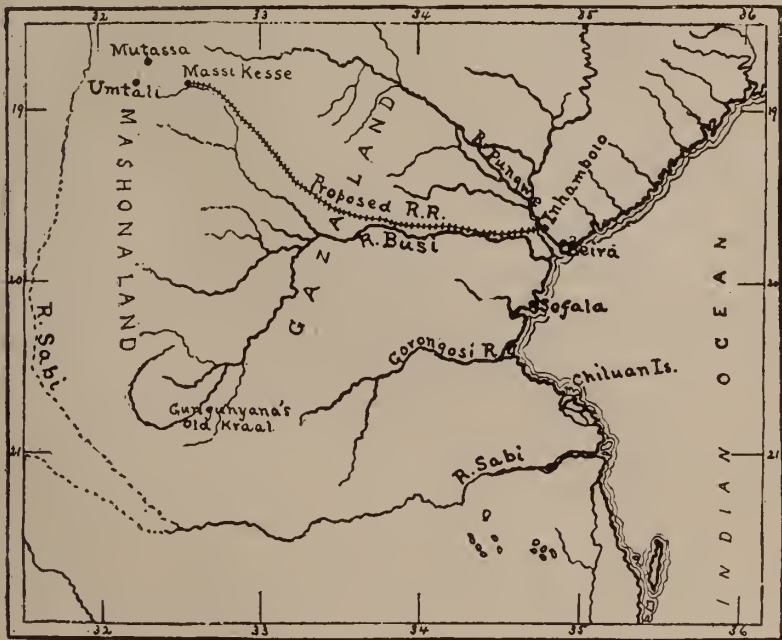
SKETCH-MAP OF GAZALAND.